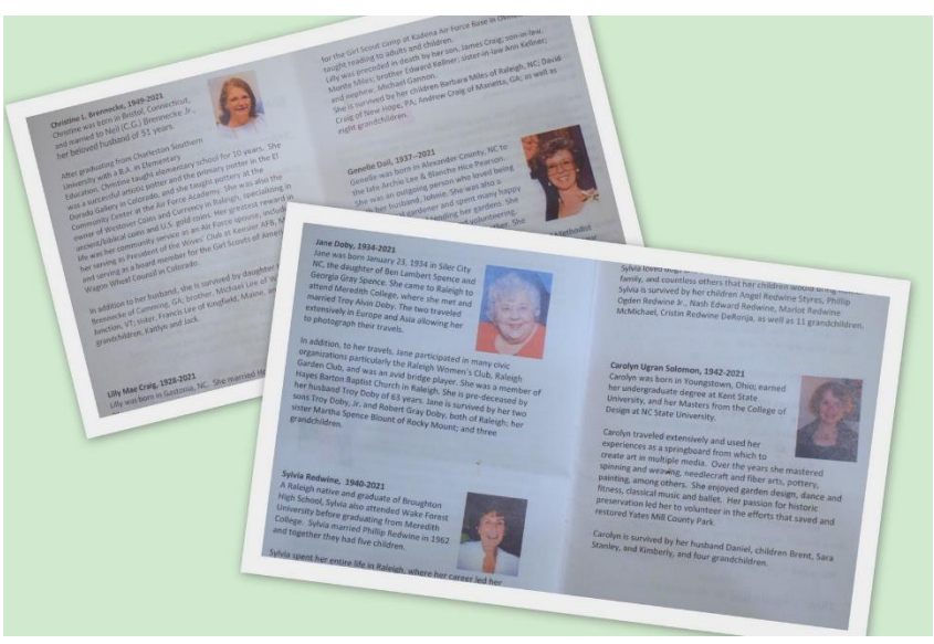
3 - Our Program is a keepsake for the friends and family of our honored members, each of whom has a tree planted for Arbor Day